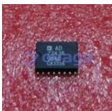
AD724JR Analog Devices, Inc SOIC-16