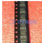
AD8170AR Analog Devices, Inc SOP8