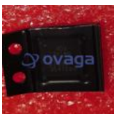
ADV7391WBCPZ Analog Devices, Inc LFSCP-3