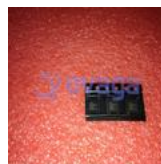
ADV7390BCPZ Analog Devices, Inc QFN32