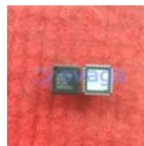
ADV7393BCPZ Analog Devices, Inc LFCSP-VQ-40