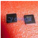
AD7181CBSTZ Analog Devices, Inc LQFP-64